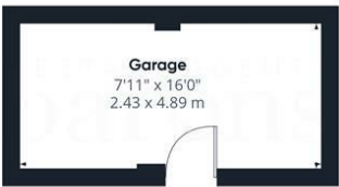
Floor 0 Building 3